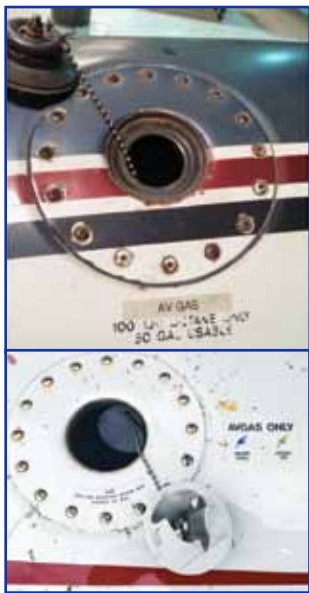
Top: A Twin Cessna fuel tank with the Jet A fuel nozzle restrictor installed Bottom: The accident 421 without the restrictor. Is the restrictor installed on your airplane?

If you use a GATS jar to sample your fuel, you can test for jet fuel contamination in the same sort of way by blowing on the screen after taking a fuel sample. Avgas will evaporate while avgas contaminated