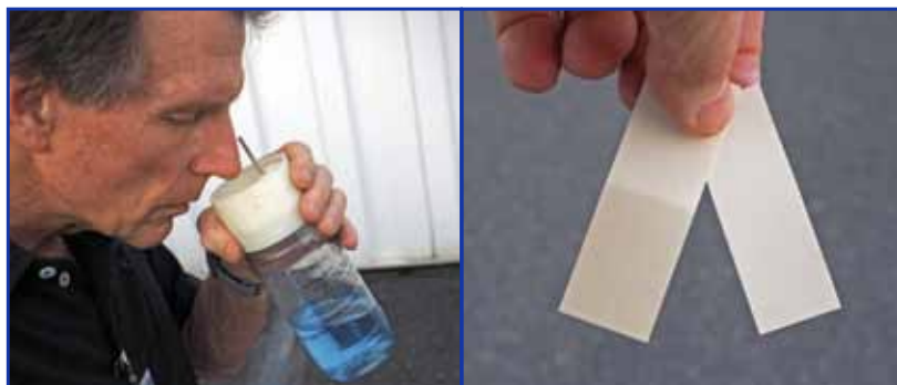
Two essential steps to prevent misfueling are: 1) Always smell your fuel. Jet fuel has a distinctive "kerosene" odor and 2) Dip the fuel sample with a piece of paper. The picture on the left dipped into a 50-50 mix of avgas and jet fuel and the paper on the right dipped into pure 100 LL. After 60 seconds, the 100LL had evaporated completely, leaving no stain whatsoever. The contaminated fuel (left) leaves an oily stain that persists for a long time. All you need is paper and one minute. Any paper will do including a fuel receipt.

Aircraft misfueling accidents are usually fatal because the mixture of avgas and Jet A allows the aircraft to be started and to takeoff without any indication of a problem. But as full power is applied, the engine temperatures begin to rise rapidly until destructive detonation occurs, usually after the aircraft is