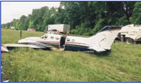
Misfueling accidents in piston twins are often fatal. The owner of this 421 was lucky to walk away with minor injuries.

In April of this year, one of our members who owned a 1975 421B survived a crash landing due to a dual engine failure in IMC. His airplane had been misfueled with Jet A. His accident was the third misfueling accident to occur since August of 2014. The other two were fatal, and one of them involved another 421.